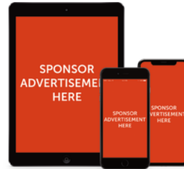
Required Images (width x height)