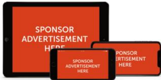
Required Images (width x height)

Available in Portrait or Landscape, ensure attendees see your ad with 3.5 seconds of a splash screen when attendees launch the app. The screen is not clickable but serves as a digital program book cover!